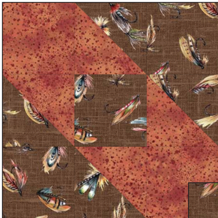
Blocks shown in Rod & Reel collection 23328-36 & 23332-24